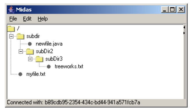
Figure 3: The Midas metadata-store ServiceUI window

WebDAV is based on the HTTP protocol (Fielding et al. 1999). It is well supported by open-source Slide project (Jakarta Project 2005). As a matter of fact, this allows us to use the standard Java Servlet implementations for the adapter. It can be used within any Java Servlet engine, such as Apache Tomcat (Apache Tomcat Group 2005).